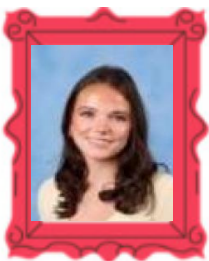
SCARLETT DEPUTY HS (RESPECT)