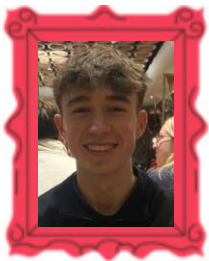
HARRY DEPUTY HS (ASPIRATION)