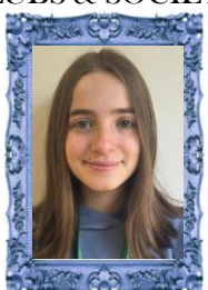
HATTIE HEALTH & WELLBEING