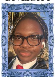
TENI CLUBS & SOCIETIES